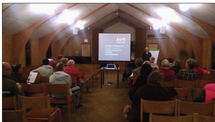
Above: Participants joined in a facilitated discussion after a viewing of "Race: The Power of Illusion" on Wednesday, February 18.

Participate in conversations online by following us on Facebook and joining that All Souls Facebook group.