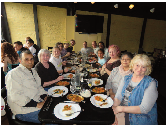
Above: All Souls members enjoyed dining together in Omaha on May 7. Every one agreed it was a fun trip and are hoping for a repeat trip in 2017.