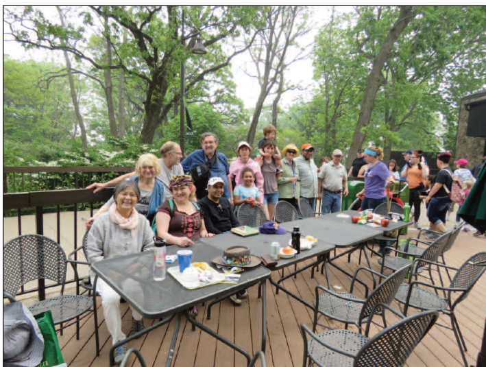
Above: All Souls members take a break while touring the Omaha zoo.