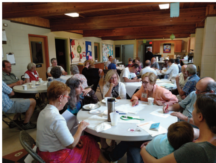
Above and Below: Brainstorming session participants on July 10, 2016.